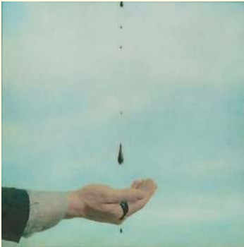
Robert and Shana ParkeHarrison