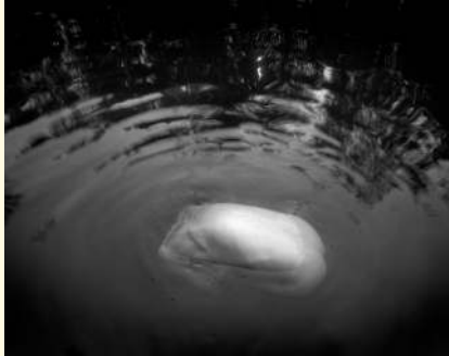
Arno Rafael Minkkinen